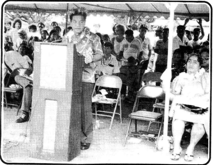
INDEPENDENCE DAY - President John R. Haglglam, at the podium, is addressing the crowd and the people of the FSM via satellite during ceremonies held at the Little League ballfield commemorating the Second Anniversary of the FSM Independence Day.