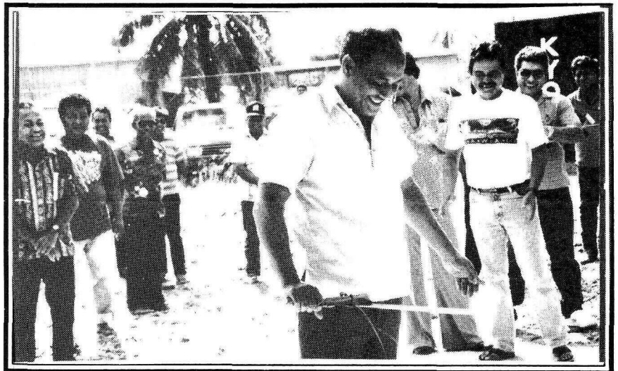
GOVERNOR CUTS THE RIBBON - Pohnpei State Governor Resio S. Moses with a machete cuts the coconut palm leaves which were tied in front of the warehouse substituting the usual ribbon, to permit the attendants to enter the building.