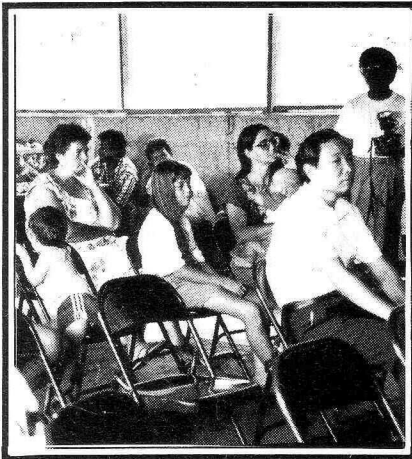
RIKADA RECYCLING FACILITY - In front is Charge d'Affairs of the Embassy of China located in Pohnpei, among others who joined together in the dedication of the Rikada Recycling Facility.

The ceremony ended with a demonstration of the can crushing machinery which can crush 1,000 cans per minute or 60,000 cans per hour. Master of Ceremony Bermin Weilbacher told the crowd that FSM imports approximately 7 million aluminum cans each year.