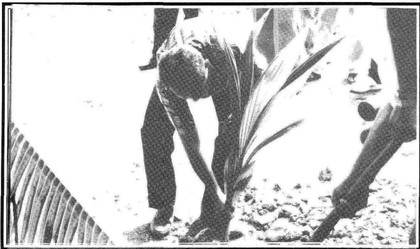
COCONUT PLANTING - Pohnpei State Legislature Vice Speaker Ioanis Edmund is planting a young coconut tree in front of the building signifying the primary use of the building.