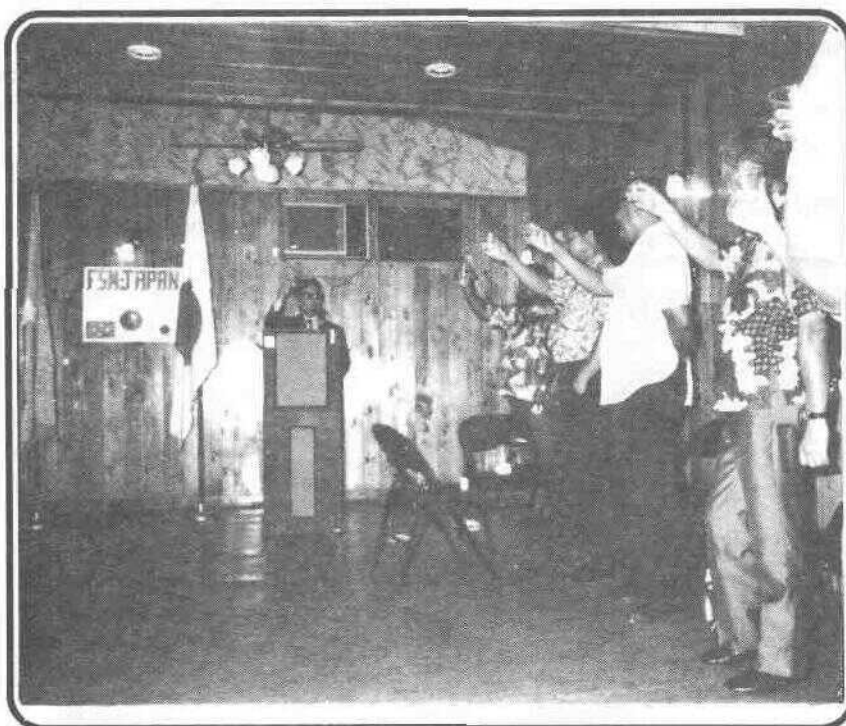
JAPAN TOASTED FSM - Japan Rep. to the ceremonies toasted FSM during a reception held at PCR on Dec. 19.