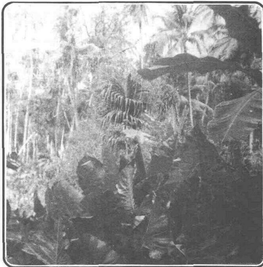
KAPINGA FACES DROUGHT - The photo depicts some of the coconut trees and vegetation on Kapingamarangi showing signs of the drought. See story on Page 10.

The conference was postponed to accommodate funeral activities for late Speaker Fritz Hartmann of Truk, Luey said.