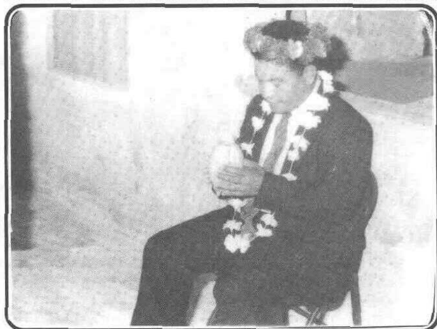
PRESIDENT ACCEPTS THE TITLE IN A DRINK - President Haglelgam, after having been crowned with the title of "Luhk Pailhelap Selpel" accepted it with a coconut drink.